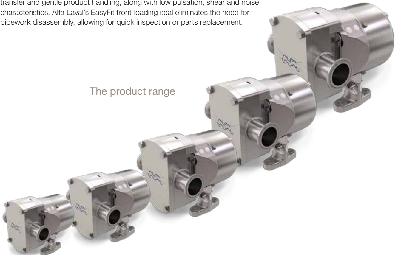
The product range

All models in the range ensure high process flexibility with dependable fluid transfer and gentle product handling, along with low pulsation, shear and noise characteristics. Alfa Laval's EasyFit front-loading seal eliminates the need for pipework disassembly, allowing for quick inspection or parts replacement.