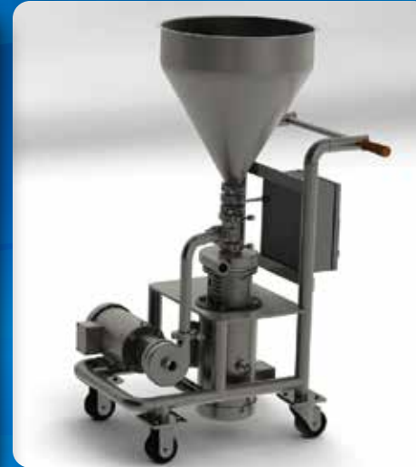
MODEL AC+2116 SYSTEM

Powder addition rate: up to 50 lbs. per minute (23kg/min) Normal liquid flow rate: 40 GPM (9.1 m 3 /hr) Powder addition inlet: 2 inch Liquid inlet: 1-1/2 inch (at feed pump) Liquid outlet: 1-1/2 inch Clamp connection standard Close coupled to a 5HP, 3600 RPM motor Shipped complete with supply pump, control panel and cart